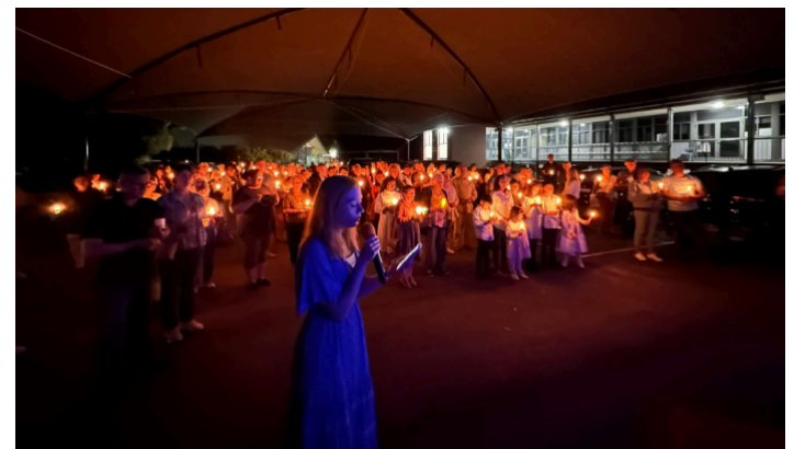
The large crowd praying the Rosary.