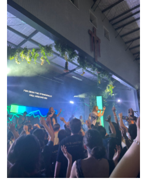
Images from Ignite Conference